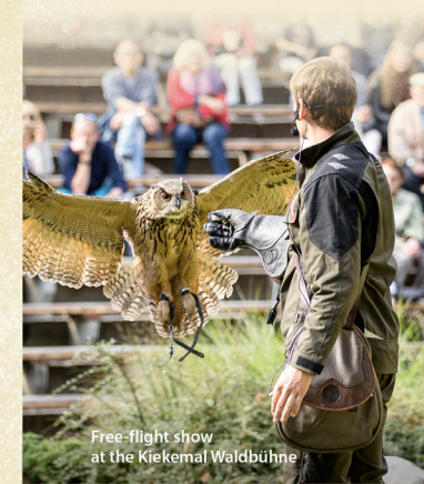
Free-flight show at the Kiekemal Waldbühne